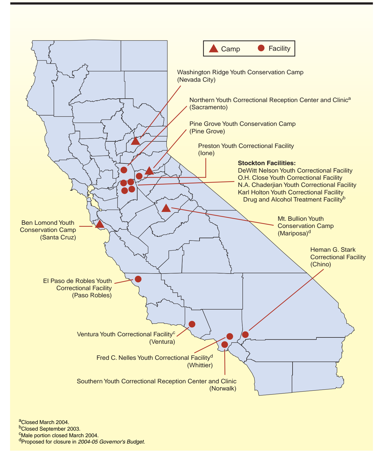
Figure 1 California Youth Authority Institutions and Camps